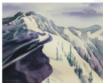
"Purple Mountain Majesty" by Kaaren Marcquez, 11x14" watercolor

"Purple Passion" features works by all fifteen of the gallery's artists. Each piece includes shades of purple, a color that has a variety of meanings. Traditionally, purple has been associated with wealth, royalty and luxury as well as loyalty and bravery. More recently, research has found that purple is known to promote creativity and has a calming effect. This annual group show reveals fifteen different artistic interpretations and highlights each artist's style and strengths. From abstractions to florals, landscapes to wildlife, this exhibition reveals the versatility and complexity of the color purple.