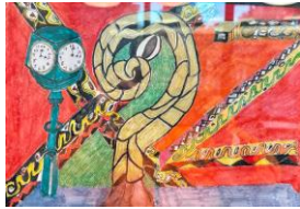
Los Altos Art Sculptures by Charlotte Montgomery